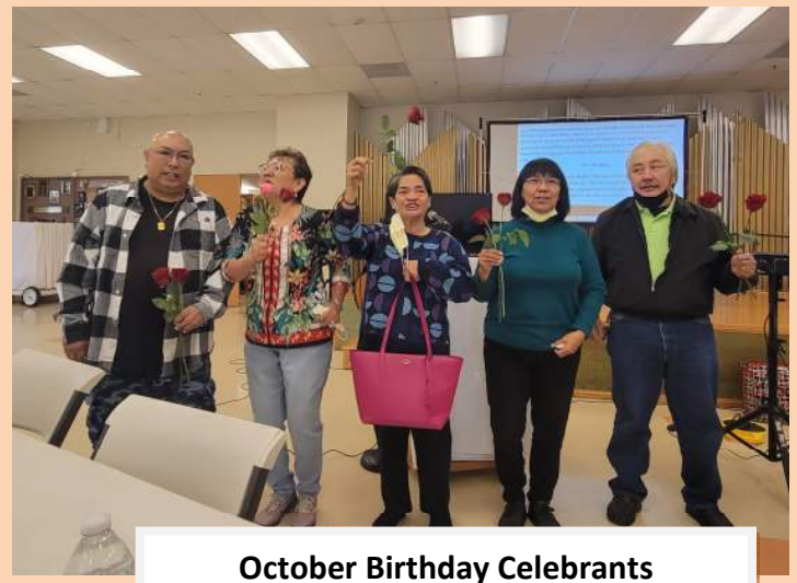
October Birthday Celebrants