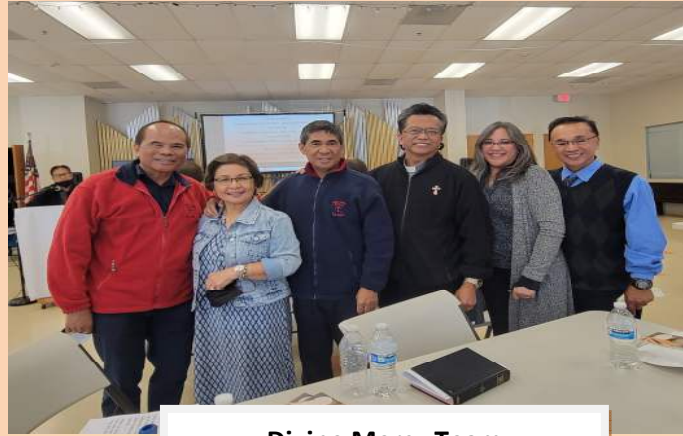
Divine Mercy Team