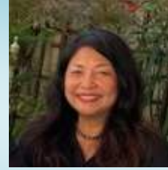
Sis Joy Inocencio Our Lady of Holy Rosary

Sorrento is specially a beautiful coastal town in southwestern Italy, facing the Bay of Naples on the Sorrentine Peninsula. Perched atop cliffs that separate the town from its busy marinas, it's known for sweeping water views and Piazza Tasso, a cafe-lined square. Piazza Tasso is a central place and square in Sorrento in the south of Italy. The area is famous for its lush lemons and all the wonderful products they make from them.