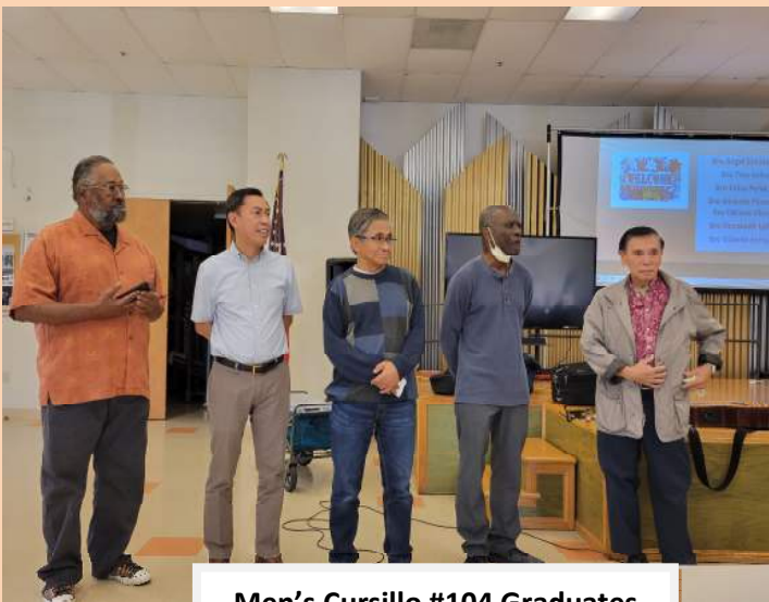
Men's Cursillo #104 Graduates