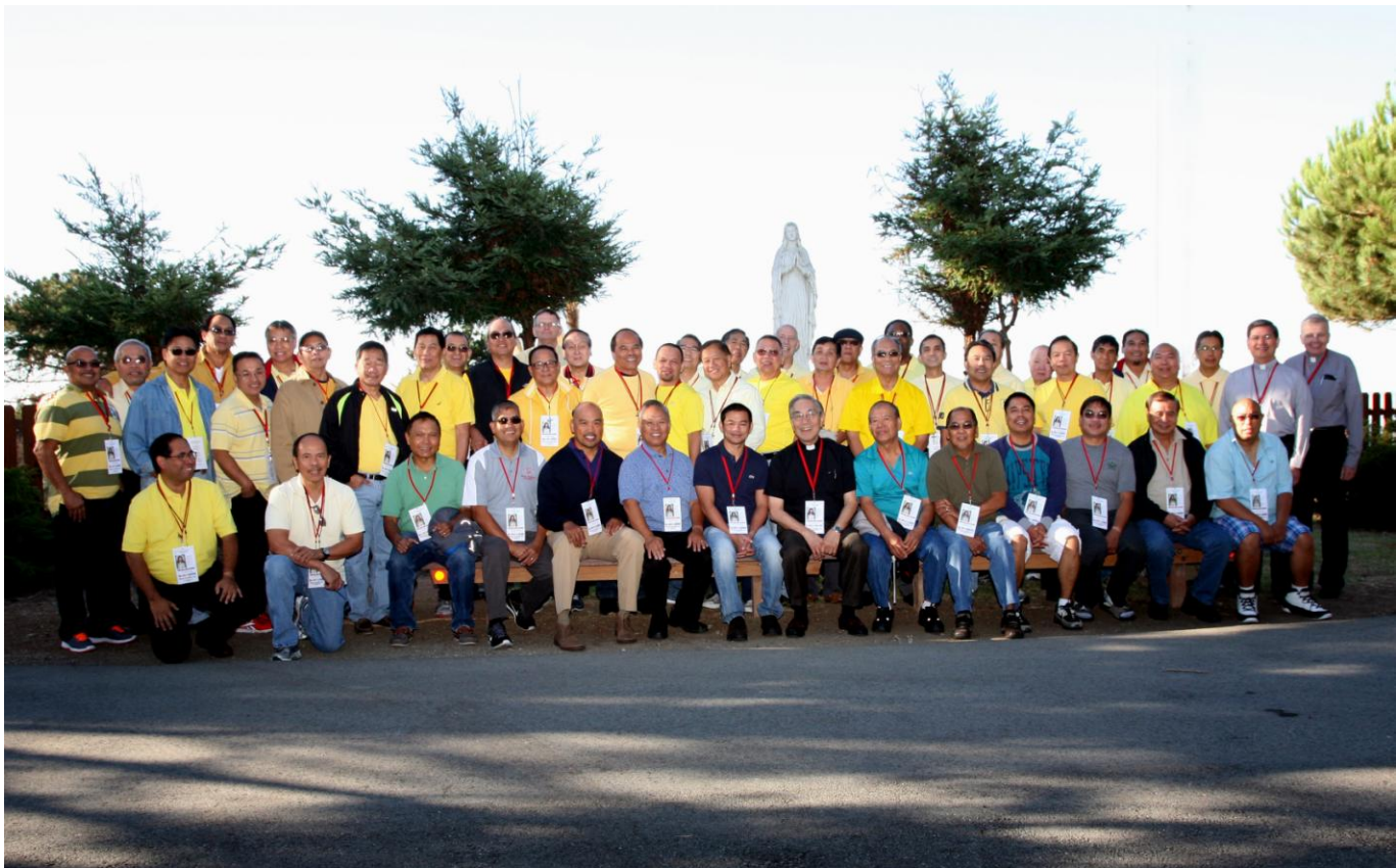
The Men's Cursillo #90 graduates and auxiliaries