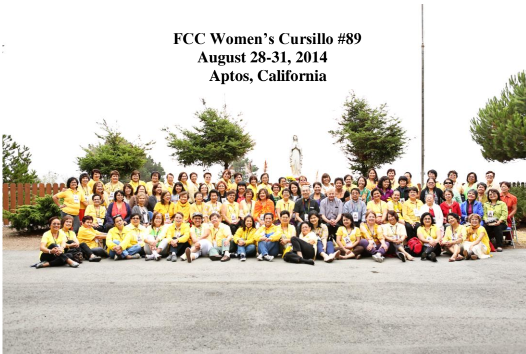
FCC Women's Cursillo #89 August 28-31, 2014 Aptos, California