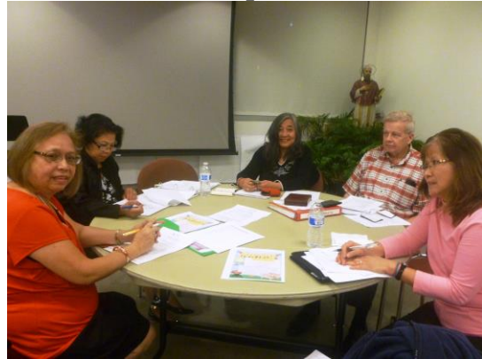
The Team Reps Attendees