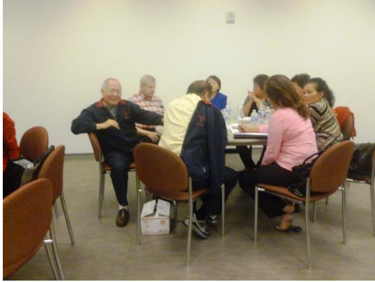
GOODBYE OUTGOING SECRETARIAT OFFICERS